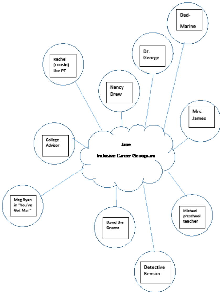
Figure 1: Jane's Inclusive Career Genogram